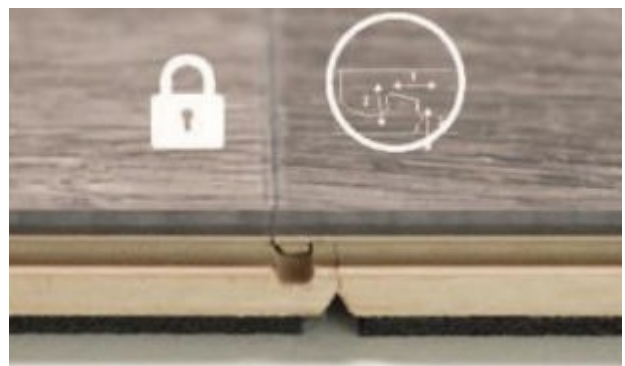
6. Planks are now fully locked