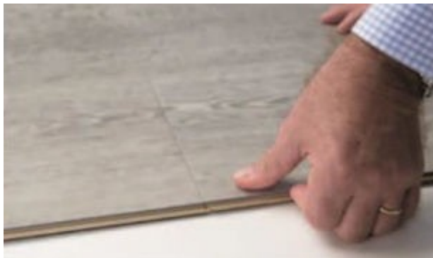
3. Press with your thumb on both ends of the short side