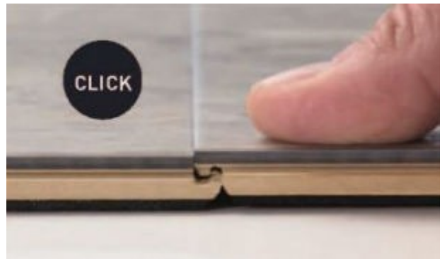
4. Continue pressing until you hear the 'click' sound of the one piece Drop Lock System