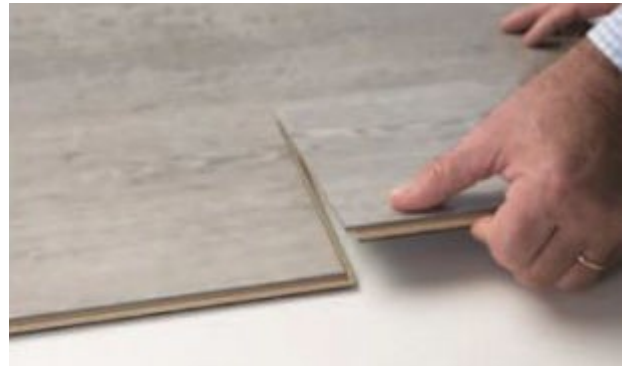
2. Slide the plank until it reaches the short side of the next plank and drop gently