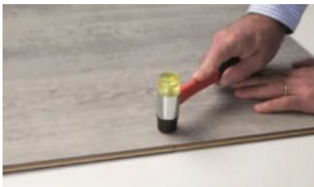
5. Hit gently with a soft-faced hammer on both sides of the short-end